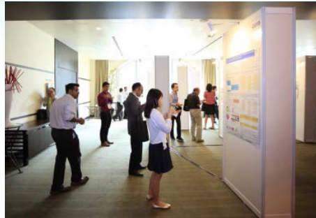
Abstract Poster Displays