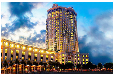
Grand Copthorne Waterfront Hotel 392 Havelock Rd, Singapore 169663

Oral and Poster Abstract submissions: 170