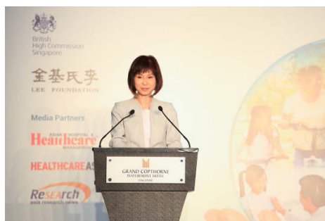
Opening Address by the Guest of Honour Dr Amy Khor, Ministry of the Environment and Water Resources & Ministry of Health, Senior Minister of State