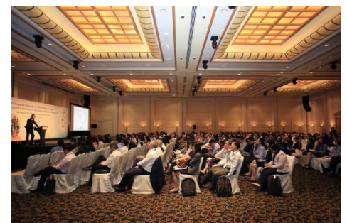
Grand Ballroom at Level 4