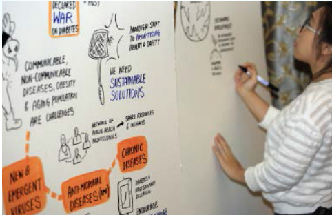
Singapore's War on Diabetes